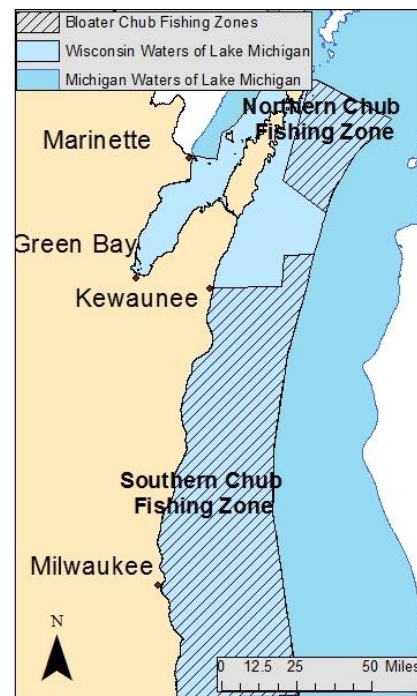
Figure 1: Wisconsin bloater chub commercial fishing zone boundaries. Boundaries are defined in NR 25.02(47) and (57).

SECTION 4 deletes an outdated section from NR 25.07 (2) (a) and, within the year-round open season, removes the “quota periods” harvest limits of chubs from the northern chub fishing zone that are based on harvest at certain times of the year. SECTION 4 also simplifies the rules for allocation of the total allowable commercial harvest of chubs from the southern chub fishing zone and describes the process for permanent transfer of individual licensee catch quotas. Harvest allocation shall be allotted among 32 individual licensee catch quotas as a percentage of the total allowable commercial harvest. In addition, no individual licensee catch quota allotted to a permittee may exceed 70,000 pounds until each allotted individual licensee catch quota equals 70,000 pounds. When all individual licensee catch quotas each equal 70,000 pounds, any further increases shall be divided equally